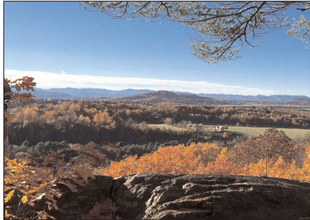
The view from Raven Ridge, a property conserved by the Nature Conservancy with assistance from the Charlotte Land Trust, in 2010.