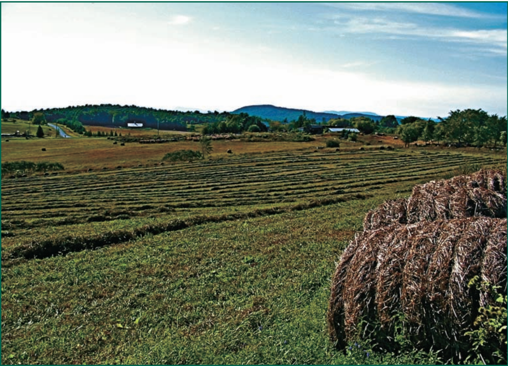
Hay bales on recently conserved Burleigh Family Farm

Helping to Protect and Preserve the Rural, Agricultural Landscape of Charlotte