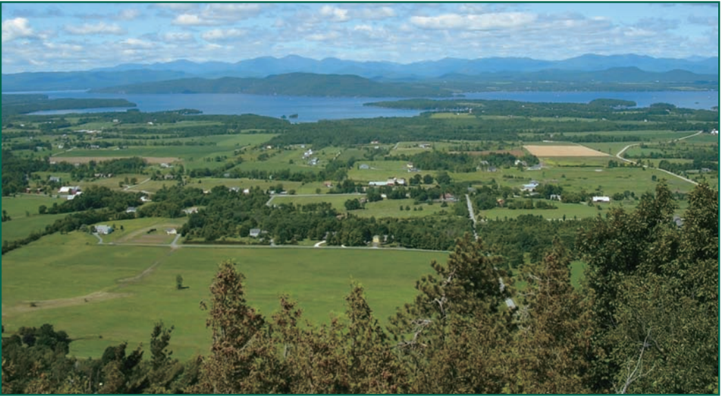
View looking west from Mt. Philo with recently conserved field in foreground.

This project was made possible through the collaborative efforts of these two organizations and the Charlotte Land Trust and Lewis Creek Association. Three years of perseverance were rewarded in generous funding and support from the State of Vermont Housing and Conservation Board and the Town of Charlotte. Other funders included the Charlotte Land Trust, Vermont's Agency of Natural Resources Clean and Clear Program, Lewis Creek Association, area foundations and many supportive community members. CLT played a vital role in helping to achieve the project's fundraising goals and is forever grateful for the wonderful generosity of all of its donors who care so deeply about protecting the very special places of Charlotte.