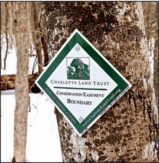
New easement boundary marker on conserved property.

The Fund will once again be up for renewal at Town Meeting in 2016. It's not too early to think about what the Fund has done for our town and what a good value it has been. The CLT board encourages you to support renewal of the Fund next Town Meeting Day.