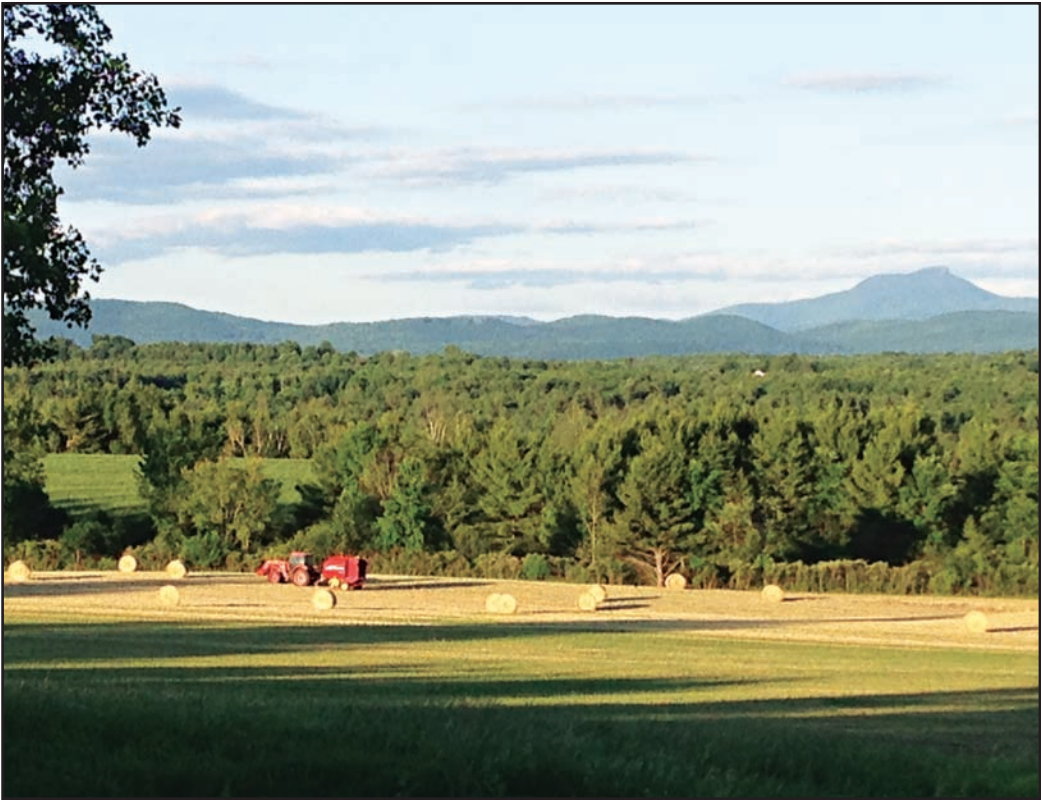
Haying on conserved land off Mt. Philo Road.

The Charlotte Conservation Fund has been central to the success of land preservation in Charlotte for many years. Established in 1996, the Fund has helped conserve 1,687 acres. The $1,397,951 expended from the Fund has leveraged $6,653,189 of grant money from other sources. The Conservation Fund is a sound investment in preserving Charlotte's rural landscape.