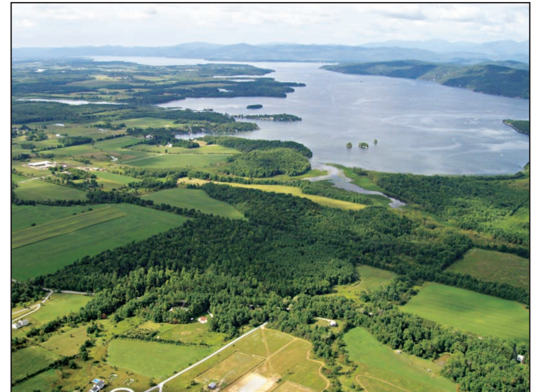
Aerial view of Williams Woods and adjoining conserved parcels.

Helping to Protect and Preserve the Rural, Agricultural Landscape of Charlotte