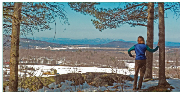
A broad view of the Champlain Valley as seen from Raven Ridge in East Charlotte.