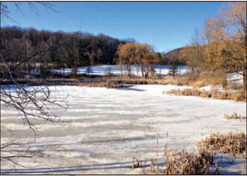
Burrill Property: CLT's newest conservation easement.