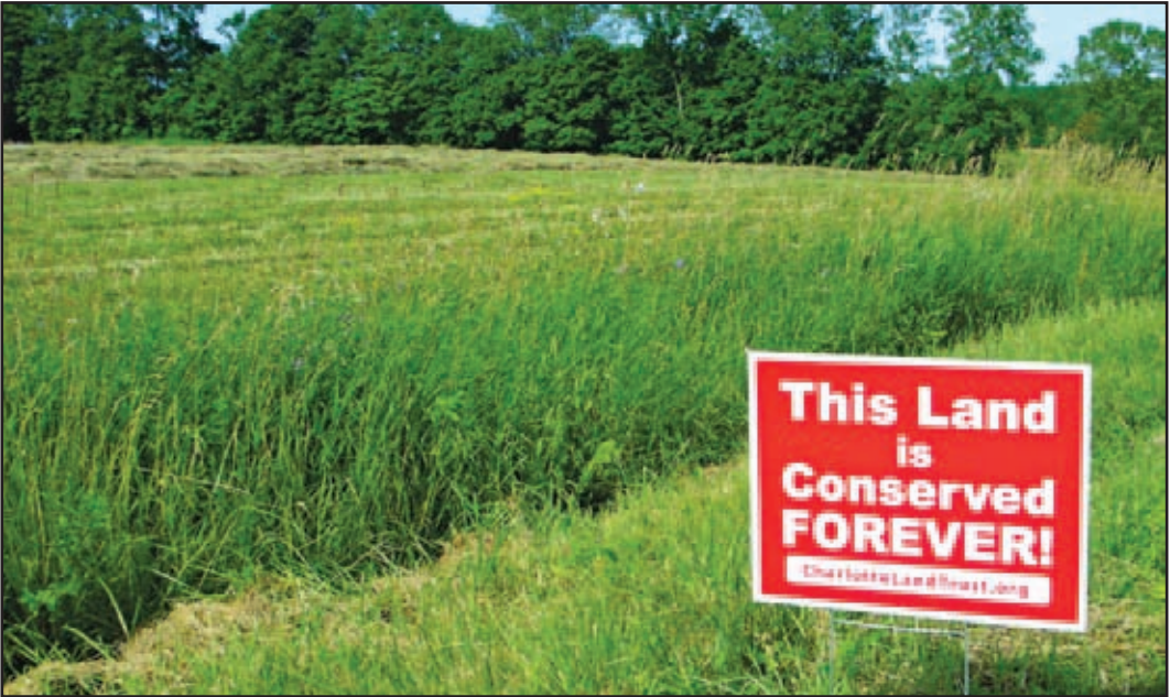
One of four red signs highlighting a conserved property, July 2013