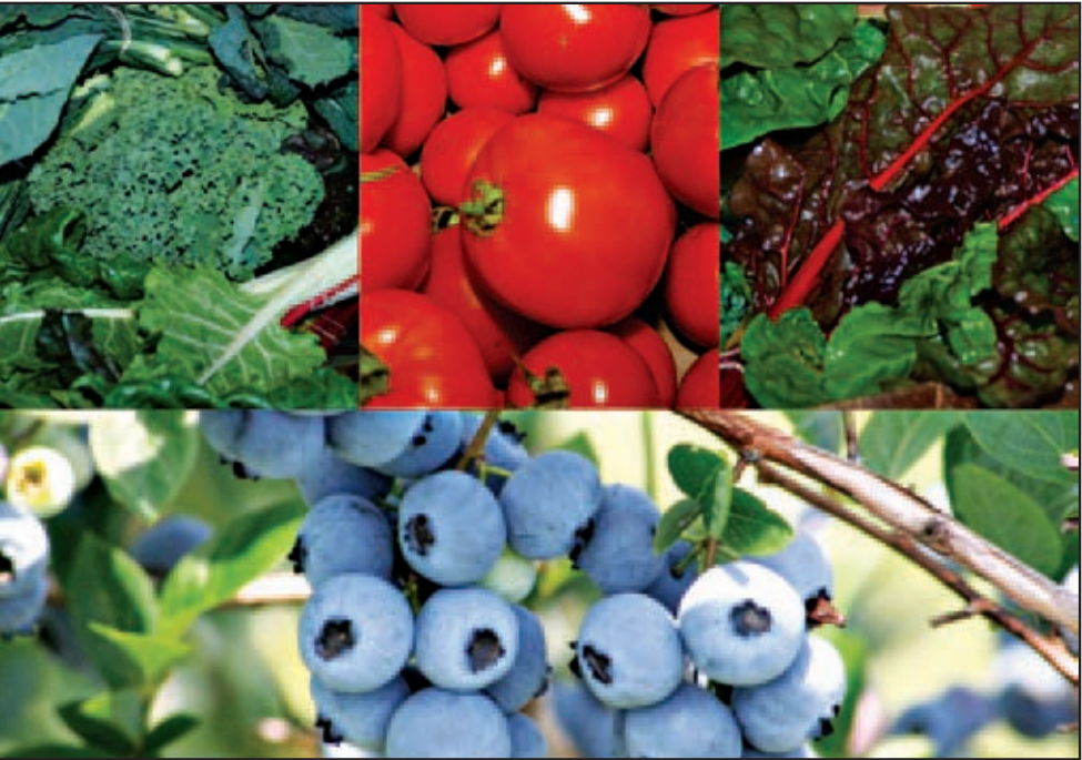
Some of the many fruits and vegetables grown on conserved land in Charlotte.

Helping to Protect and Preserve the Rural, Agricultural Landscape of Charlotte