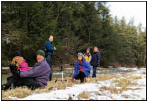
Photography students at a winter workshop sponsored by CLT on conserved land.

Donated easements, such as the one from George and Lola, are an incredible gift and