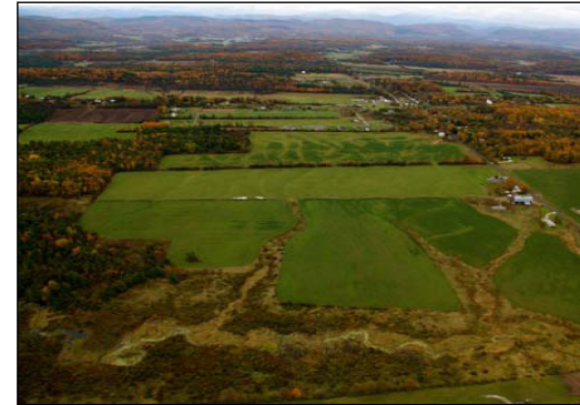
Aerial view looking south at the Nordic Holstein Farm on Hinesburg Road permanently conserved April, 2011.

Helping to Protect and Preserve the Rural, Agricultural Landscape of Charlotte